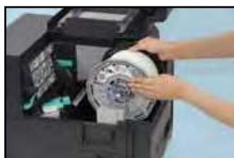
Large ouverture pour faciliter le rangement d'étiquettes