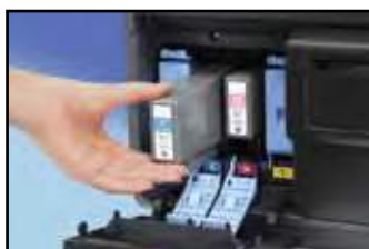
Simplicité de remplacement des cartouches

*Specifications subject to change without notice.